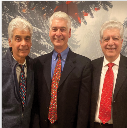
THE DEGREGORIS FAMILY & GREGORIS SUBARU